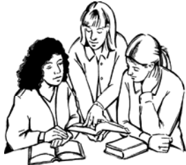
Women's Bible Study

The Women's Bible Study would like to invite all women to join us. If you are interested in attending the Bible Study or just want to ask questions, please feel free to contact Jill@ 732-547-7612. We meet on Mon. nights at 7 pm.